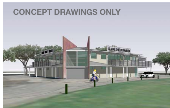
S.M.D.S.C PROPOSED EXTENSIONS